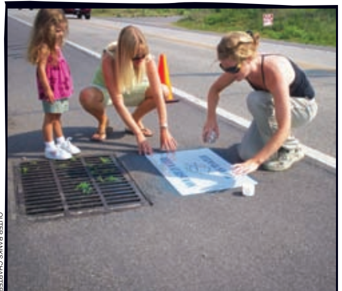
OUTER BANKS CHAPTER

Outer Banks Chapter members stenciling storm drains.